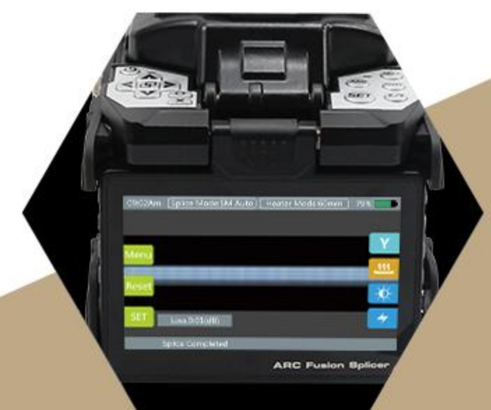
4.3" touch screen