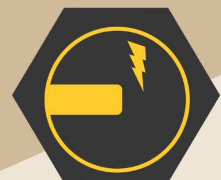
Fiber endface melter & fusion splicer 2 in 1