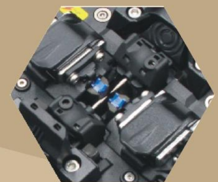
Detachable multifunction fixture