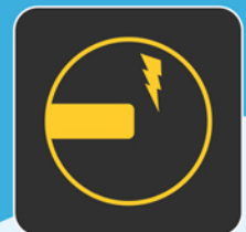
Fiber endface melter & fusion splicer 2 in 1