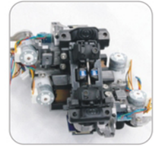
Integrated fiber-adjust frame

Optical imaging system ranks No. 1 in the world