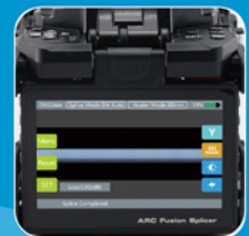
4.3" touch screen